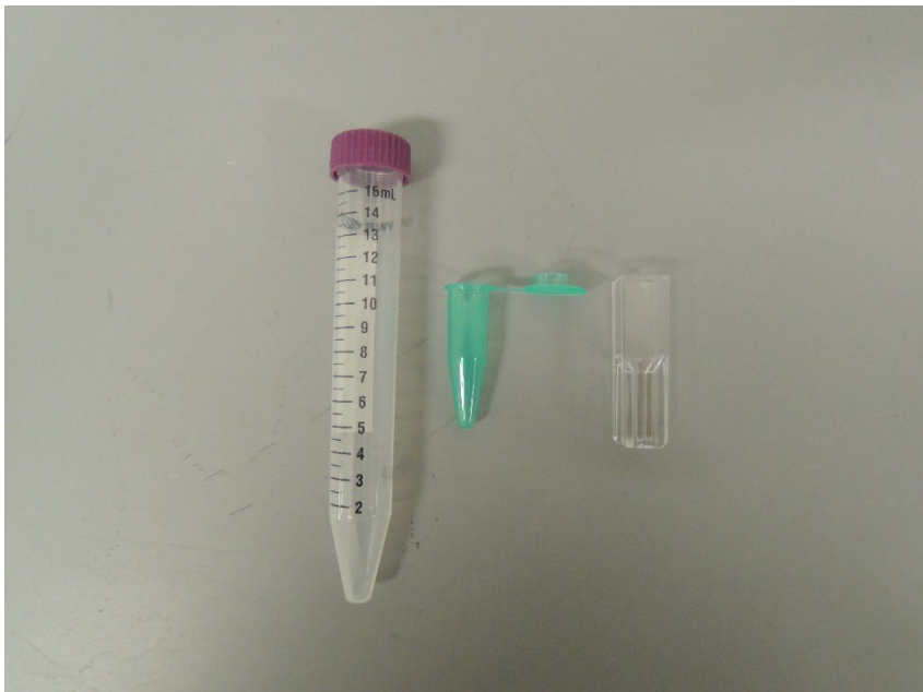
Fig. 3: Conical tube, microcentrifuge tube, cuvette (left to right)